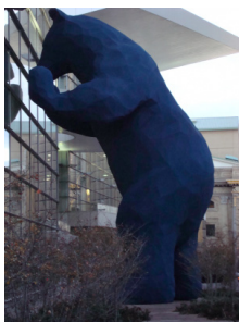
Denver Convention Centre