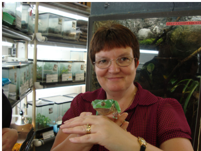
Behind the scenes - Baltimore Aquarium