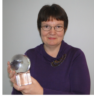
My wonderful Globe!

I have just been reviewing the reports of the AAALAC Fellows in previous IAT bulletins and I find myself in a bit of a quandary regarding what to write. The previous Fellows have done such an excellent job, what more can I add!